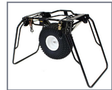
Mule II Litter Wheel